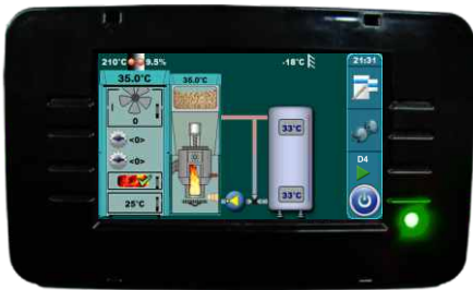
Multifunctional control with touch screen.